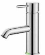
JML 7310-COZY washbasin faucet

faucet and toilet combining the self-designed water tank are a set configuration.