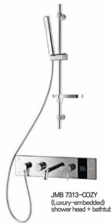
JMB 7313-COZY (Luxury-embedded) shower head + bathtub